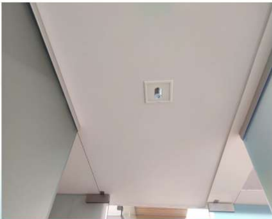
Ceiling Mounted Sensor