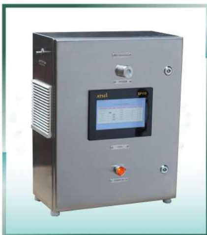
HMI + Sensor Panel