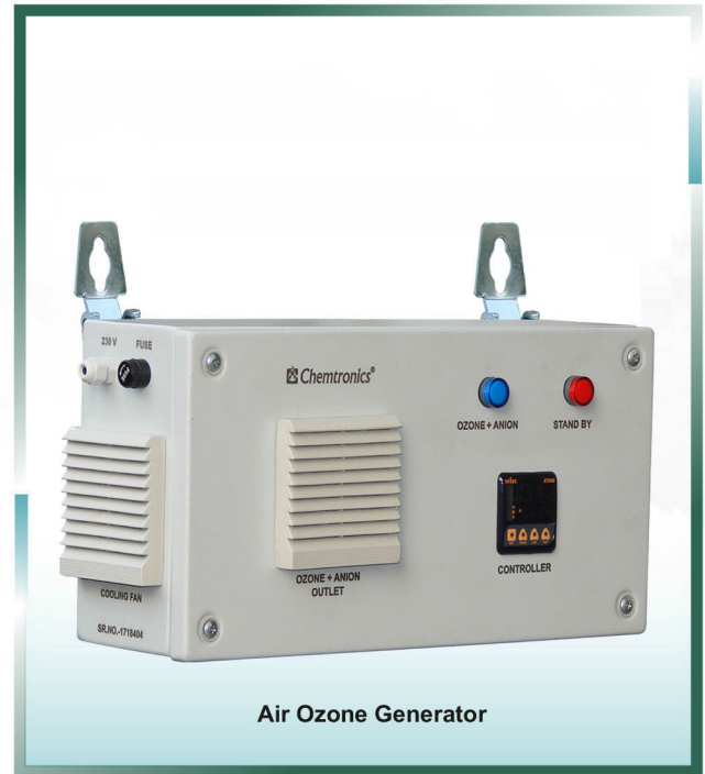
Air Ozone Generator